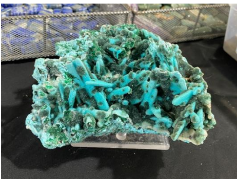
Chrysocolla, malachite and drusy quartz